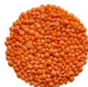
100g/ ½ cup red split lentils