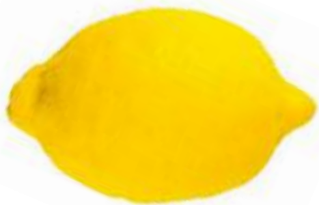
Juice of ½ lemon