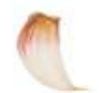
1 garlic clove, peeled and roughly chopped