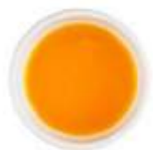
2 tablespoons oyster sauce (leave out to make this recipe vegan)