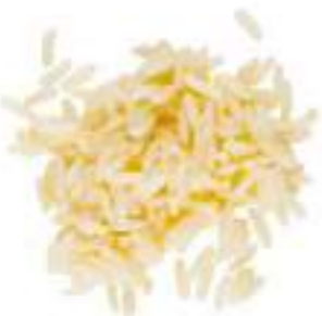
100g/ ½ cup basmati rice