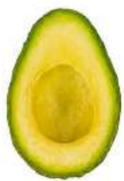
1 medium avocado