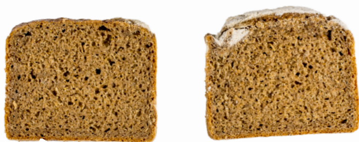
2 slices rye bread, toasted