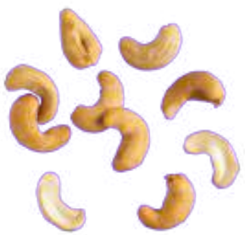
60g/ ½ cup cashew nuts