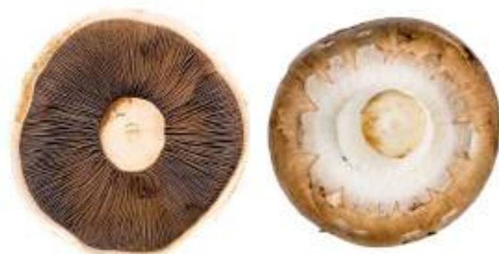
200g mushrooms, a mix if possible and chopped if large