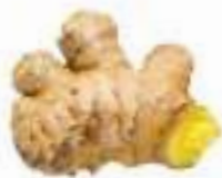
30g piece ginger, very finely sliced