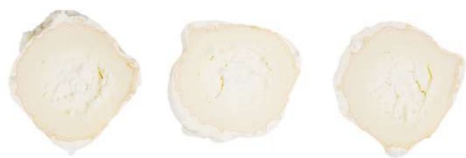
50g soft white goats cheese, sliced or crumbled