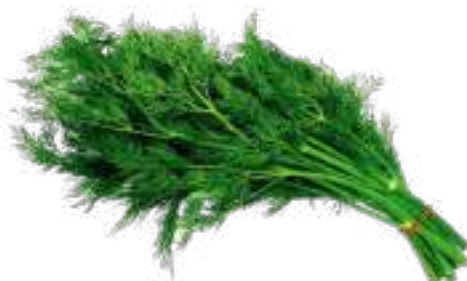
5-6 sprigs of dill, finely chopped