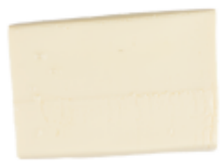
200g firm tofu