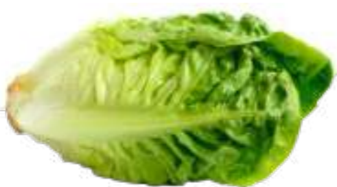
1 baby gem lettuce, leaves separated