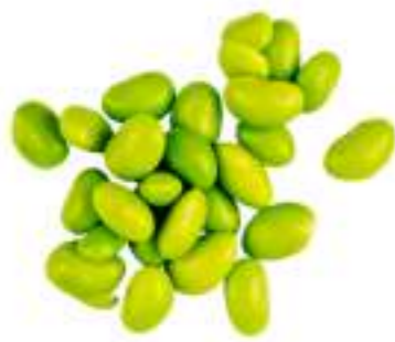
150g/ 1 cup frozen edamame beans, defrosted