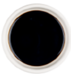
2 tablespoons soy sauce