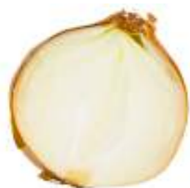
½ onion, peeled