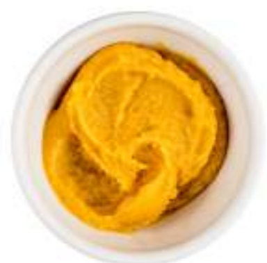
1 ½ tablespoons white miso