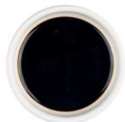
1 tablespoon soy sauce