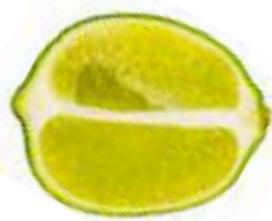
Juice of ½ lime