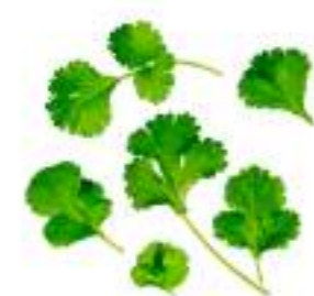
Large bunch of coriander, finely chopped