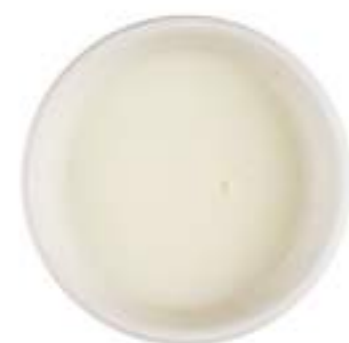
1 tin (400g) of coconut milk