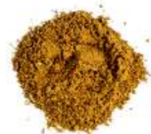
1½ tablespoons garam masala