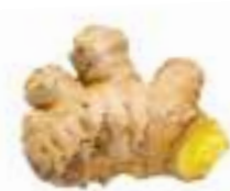
2 inch piece of ginger, roughly chopped, (no need to peel)