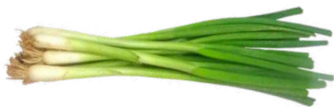
5 spring onions, finely chopped