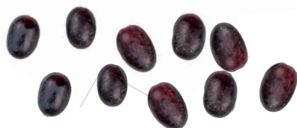
10 grapes, halved